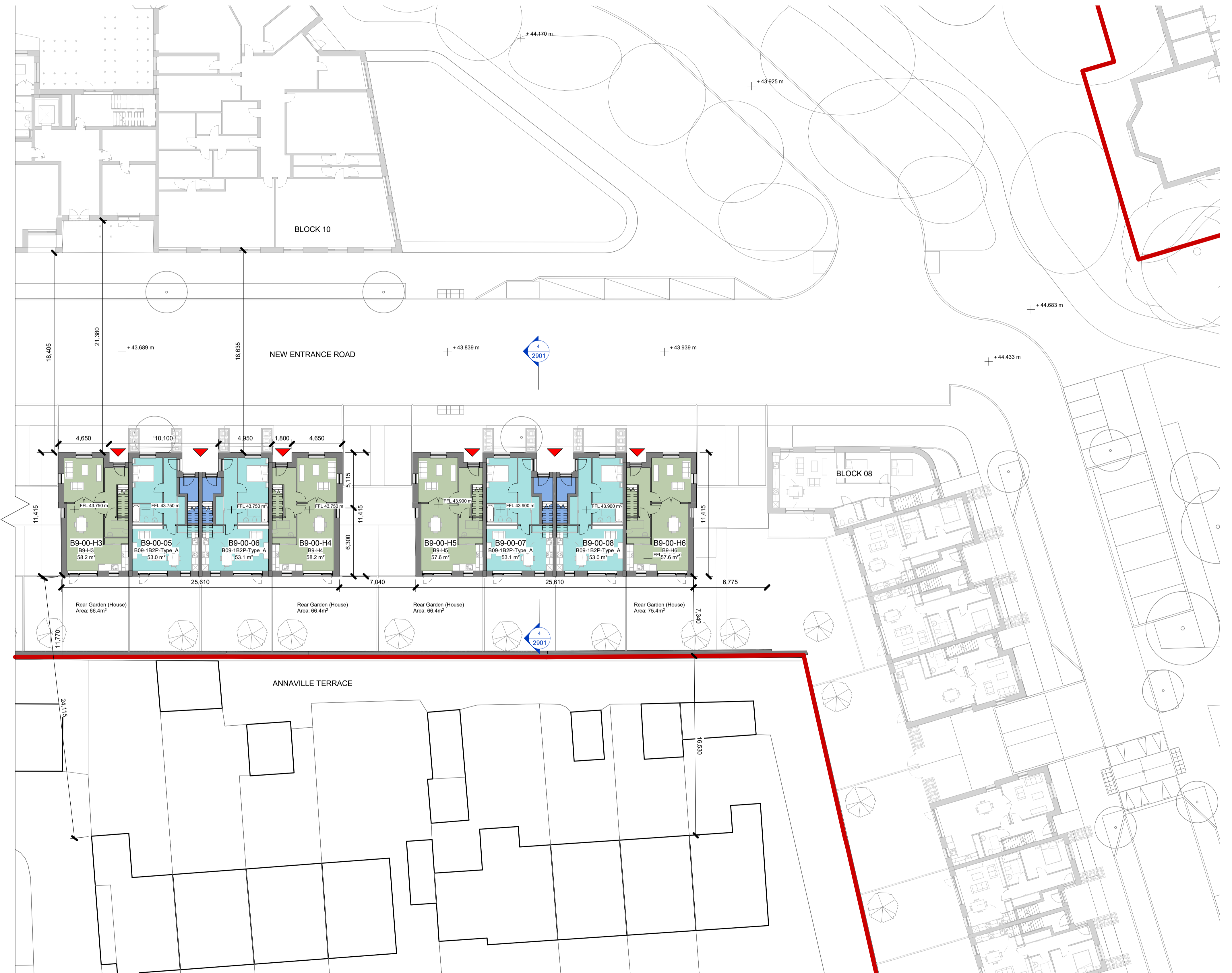
B9_L00 East 1:200

Notes: - Do not scale from this drawing. Use figured dimensions in all cases. - Verify dimensions on site and report any discrepancies to the Architect immediately. - This drawing is to be read in conjunction with the Architect's Specification. - © This drawing is copyright and may only be reproduced with the Architect's permission.